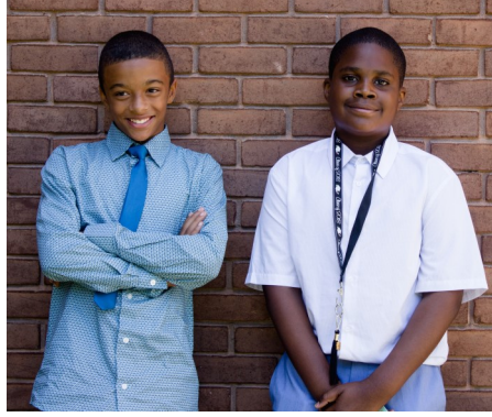
Matthew 18:5 And whoso shall receive one such little child in my name receiveth me.